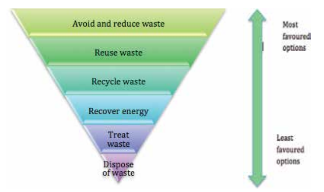
Fig. 1. Waste hierarchy (adapted from Ref. 6)

The waste hierarchy is represented as a pyramid because the basic premise is to avoid and reduce the generation of waste. The next step is to reduce the generation of waste, i.e. by re-use. The next is recycling, which would include composting. Re-use (without further processing) and recycling (processing waste materials to make the same or different products) keeps materials in the productive economy and benefits the environment by decreasing the need for new materials and waste absorption.